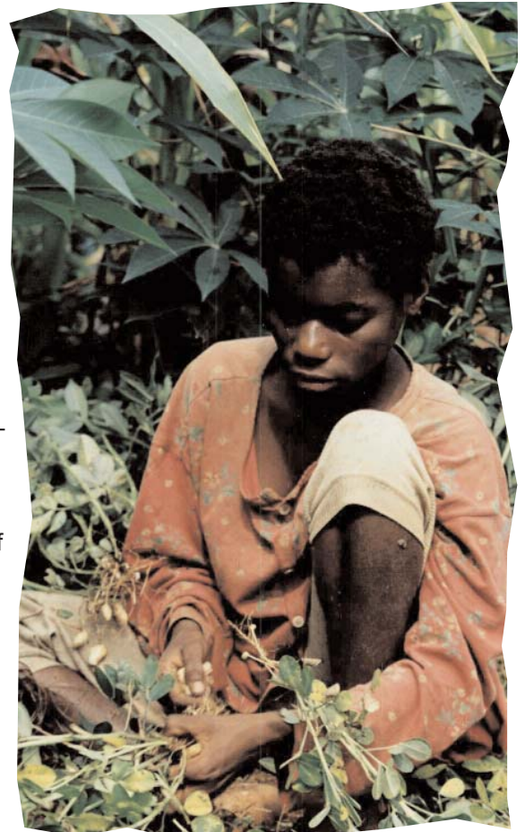
Cameroon's forest communities benefit through greater knowledge of their legal rights

The project is part-funded by the UK Department for International Development (DFID).