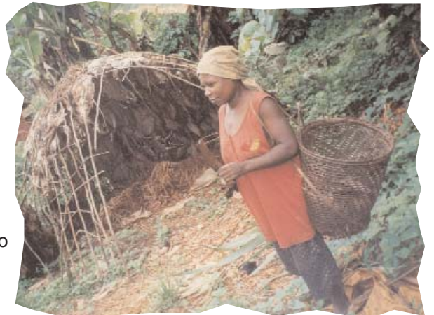
Baka 'pygmies' - excluded from decisions about the future of the forest - (c) Simon Waters/RF UK

The Rainforest Foundation's programme in the Congo Basin aims to empower local forest communities to tackle these problems themselves, and to gain equitable access and rights to forest land and resources.