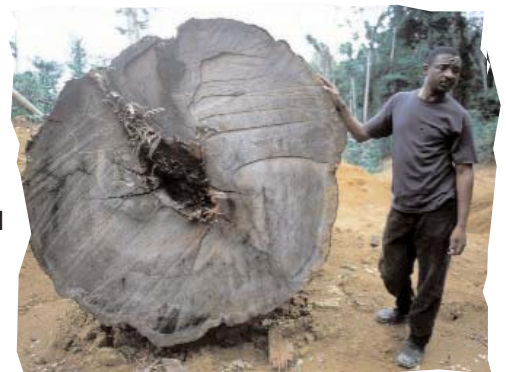
Illegal logging is rampant in the Congo Basin, including by European companies

Together with the UK-based group, Forests Monitor, the Foundation is helping civil society organisations in the Congo Basin to play an active role in tackling the critical problem of illegal exploitation of forests. The project, which was part-financed by the UK Department for International Development, provided training for key local environmentalists and forest peoples' representatives, as well as a series of local investigations into illegal forestry activities. In October 2003, the Foundation's local partners in this project presented their research and recommendations for action on illegal logging to a major inter-governmental summit on 'Forest Law Enforcement and Governance' in Africa.