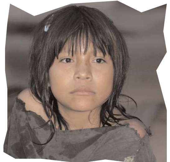
The Asháninka: victims of years of conflict, now able to determine their own future

Supported by: COMMUNITY FUND LOTTERY FUNDED