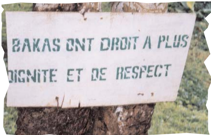
Baka communities are becoming increasingly aware of their basic rights