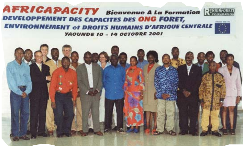
Africapacity has brought together many key African peoples rights and conservation workers for training and sharing of skills