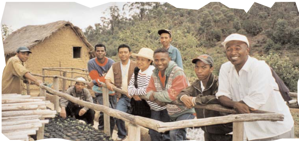
CCD Namana's field staff have helped to boost productivity, ease poverty and reduce environmental damage to agricultural land and the surrounding forests