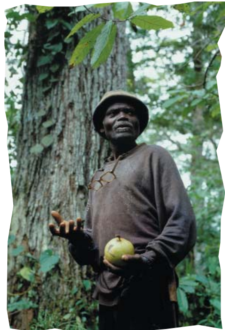
Villages need legal help in preventing destruction of valuable local resources, such as Moabi trees

The initiative will work at the local, national and international level. At the local level, key obstacles to the exercise of stronger rights by pygmy people will be identified. This will be used to inform work at the national level in the two countries, which will seek policy and administrative changes that address these obstacles. At the international level, the project will draw on relevant international agreements and standards, and will encourage the proper implementation of these in Cameroon and DRC. Specialists in indigenous peoples' rights and policy analysis, based in London, Yaounde and Kinshasa will support the project.