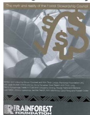
Trading in Credibility; the Myth and Reality of the FSC

Una investigación realizada por the Rainforest Foundation ha dejado al descubierto una serie de debilidades graves dentro del sistema del Consejo de Manejo Forestal (Forest Stewardship Council-FSC). La Fundación cree que es esencial que se realicen reformas urgentes y fundamentales si el FSC ha de sobrevivir como un mecanismo creible de certificación de operaciones forestales.